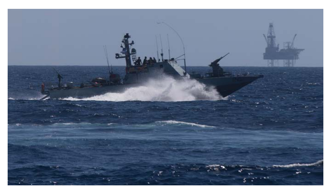
An Israeli Navy vessel passes by a drilling rig on May 27, 2013 off the coast of Ashdod, Israel in the Mediterranean Sea.

Ankara has thus opposed closer cooperation between Israel, Cyprus, and Greece in the development of their resources, arguing that the Turkish enclave on Cyprus will be deprived of its fair share of the energy revenues. Ankara has also disputed the legal maritime claims of Cyprus and Greece on which their exploration and extraction of hydrocarbons depend. Those claims rest on the United Nations Convention on the Law of the Sea (UNCLOS), to which Turkey is not a party. However, the international consensus is that the provisions of the convention have acquired the legal force of customary law, and thus, Turkey's disputes with Cyprus and Greece over the convention have dubious legal standing.