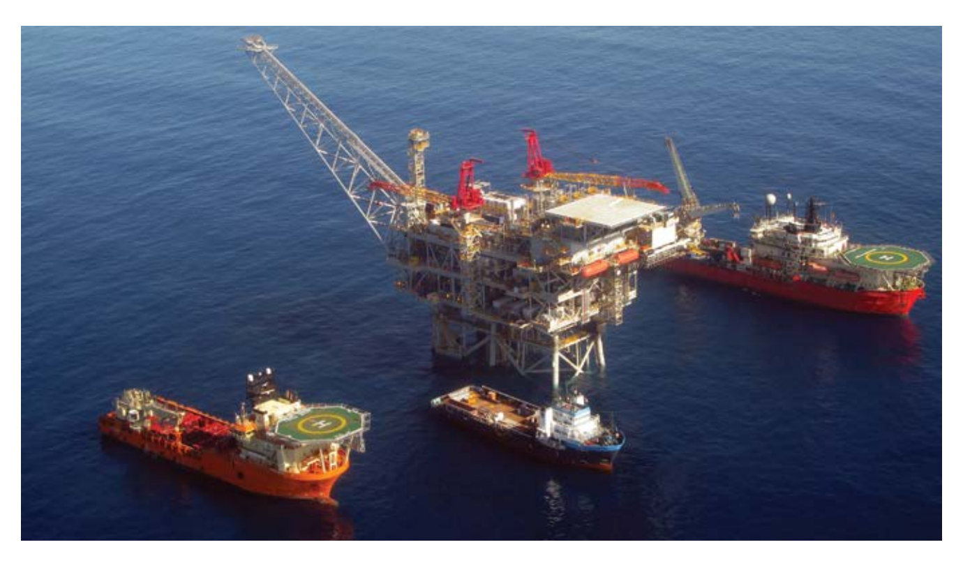
The Tamar drilling natural gas production platform is seen some 25 kilometers west of the Ashkelon shore in Israel in February 2013.

East Med. The ship's arrival will have major repercussions in what is rapidly becoming a wide-open free-for-all as the result of greatly diminished U.S. naval forces in the region and the increasing presence of Russian combat vessels.