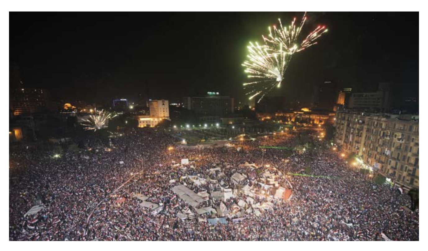
Egyptians celebrate in Cairo's Tahrir Square after Egyptian Defense Minister Abdel Fattah al-Sisi's July 3, 2013 speech announcing the army's toppling of Islamist President Mohamed Morsi.