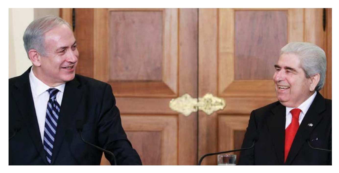
Israeli Prime Minister Benjamin Netanyahu with Cypriot President Demetris Christofias during a joint press conference after a meeting in Nicosia on February 16, 2012.

That answer depends on whose geopolitics are setting the agenda. In this, the region's liberal democracies and the Western nations more generally now have a strategic opportunity. Israel and Cyprus have been sprinting ahead with the development of their shares of the Levant Basin. Between them, the two countries now hold the largest "Western" energy reserves in the Greater Middle Eastreserves that are not controlled by Putin's Russia, by the Islamic Republic of Iran, or by any of the Gulf states. This has placed Israel-Cyprus, along with their partners in the U.S. and European governments and private sectors, in the effective driver's seat of the East Med energy revolution. Together these actors have an opportunity to proactively shape the regional energy market so as to attract the largest possible volume of outside financial investment and exploration and, through this, to maximize the energy revolution's potential security-enhancing benefits.