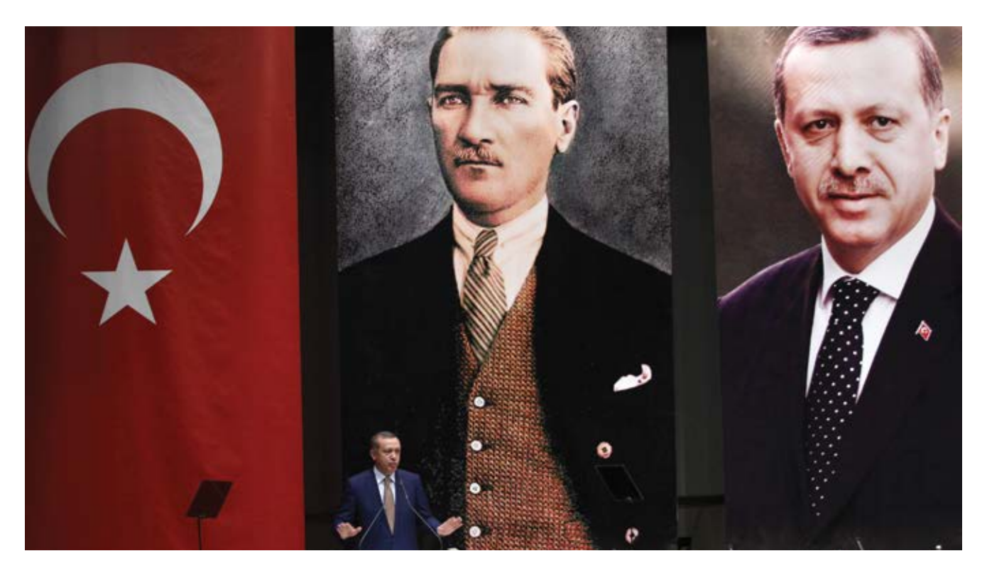
Photo Credit: Turkey's Prime Minister Recep Tayyip Erdogan addresses members of his ruling AK Party in Ankara on May 23, 2014. (ADEM ALTAN/AFP/Getty Images)

profit. The United States and the EU actively encouraged this, as it would help the countries of East Europe reduce the Kremlin's control over their supply of energy. For Turkey, becoming the transit point for Caspian energy would mean a secure supply and an opportunity to advance its bid for EU membership. Construction on the Trans-Anatolian Gas Pipeline (TANAP), which will run from Azerbaijan to Europe, is slated to begin in 2014, with a completion date of 2018.21