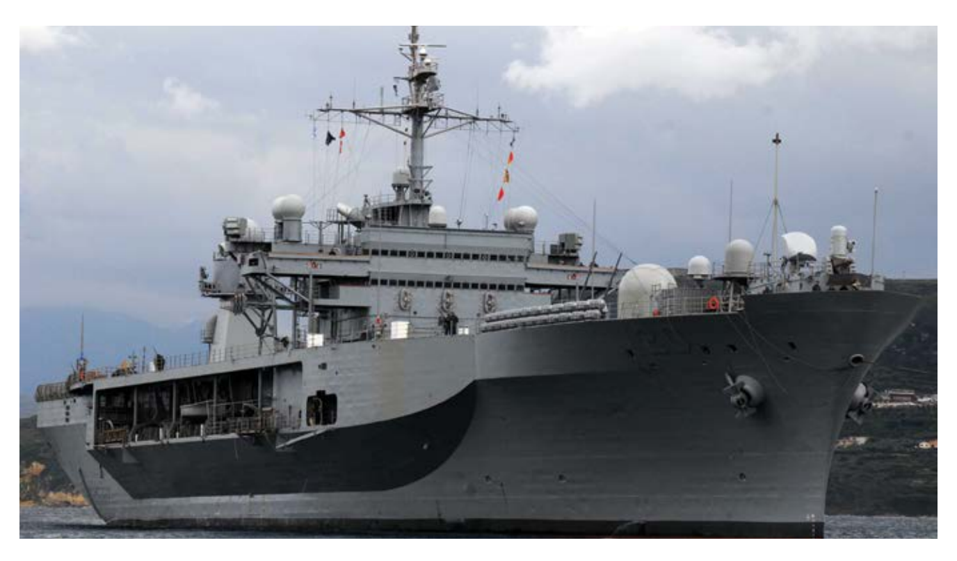
U.S. Sixth Fleet flagship USS Mount Whitney (LCC 20) arrives at Marathi NATO Pier, Feb. 28, 2012

as it is, have increasingly come under new pressures from forces intent on pushing them aside.