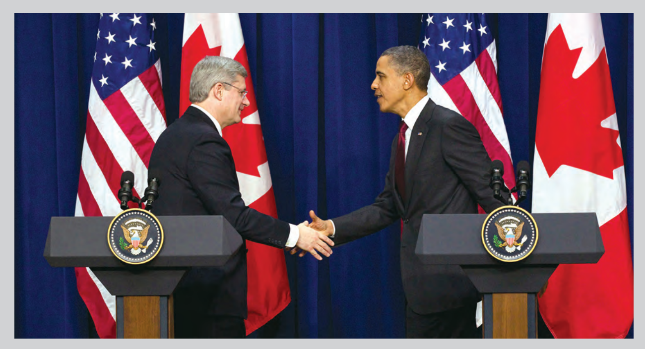
On December 7, 2011, President Barack Obama and Prime Minister Stephen Harper unveiled the Beyond the Border (BTB) Action Plan and the Regulatory Cooperation Council (RCC) Action Plan.

and like-minded business allies. Canada must therefore be focusing outreach campaigns on U.S. businesses that benefit from expedited trade with its northern neighbors.